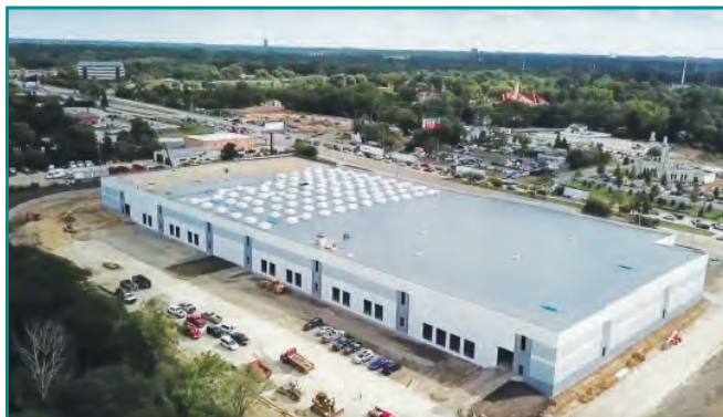
Duke Realty redevelopment on 17-acres off of North Ave.

In 2018, the Village continued to focus on economic development along the North Avenue corridor. Staff worked extensively with Duke Realty on redevelopment of an unincorporated 17-acre area on the north side of North Avenue, just west of Swift Road. The area was annexed and redeveloped with an 180,000 square foot industrial building. This very exciting project extended the Village boundary eastward, and eliminated a blighted area along the gateway to Glendale Heights.