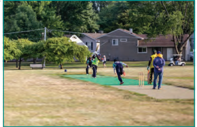
A new cricket field was added to Camera Park

The Facilities Division is responsible for the maintenance and upkeep of all Village facilities. They have been instrumental in renovating current buildings and work diligently to provide the residents with clean and updated facilities. In 2018, the Facilities Division assisted the Parks Division in repairing the bridge at College Park and in constructing several new park signs.