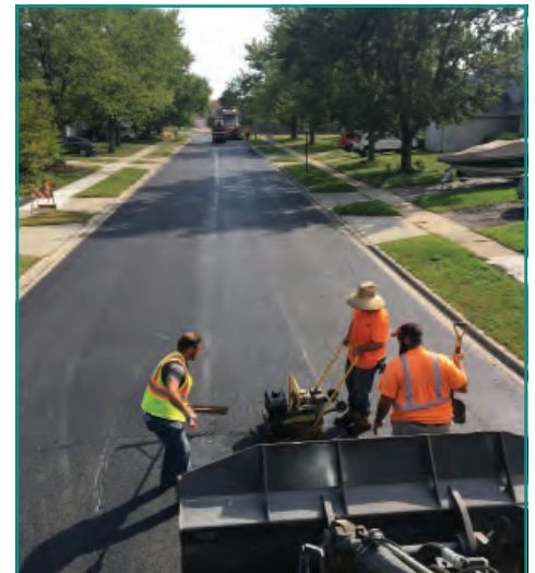
The in-house road program overlayed Fallbrook Dr., Floyd Brown Ln., Keating St., and Elizabeth Ave.

The Village also completed a Capital Improvement Program to assist in budgeting for necessary improvements to meet new and pending discharge standards as required by the IEPA.