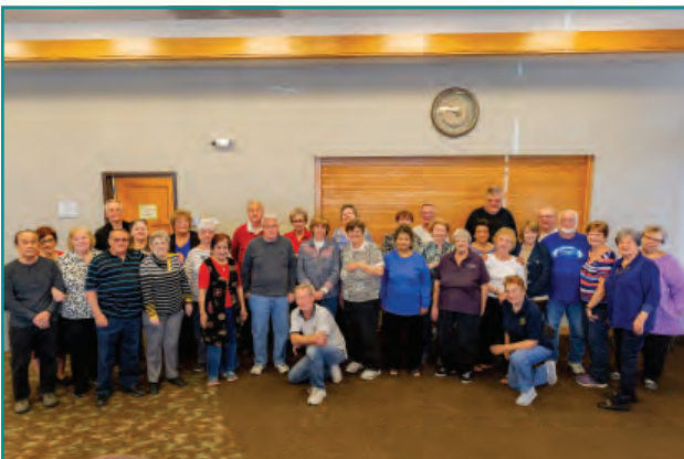
The Center for Senior Citizens has just under 2,000 members

The Center for Senior Citizens offers comprehensive senior citizen resources, innovative programming, information sessions, social events and exciting trips. The Center was designed with the active senior in mind and includes a game room, fitness room designed for older adults, arts & crafts room, as well as a full-service salon. The Center has a library with a cozy fireplace, filled with great books and four computer stations with internet access.