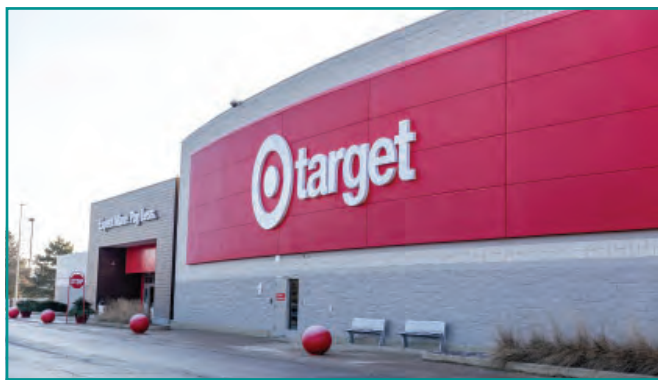
Target remodeled their facility both inside and outside

Additional projects were approved or are currently under construction including Freddy's Frozen Custard and Steakburgers at the northwest corner of Glen Ellyn Road and North Avenue, which will begin construction in the spring of 2019. Construction of a new Jeep dealership was approved in 2018 and is currently under construction, and permits were issued for construction of a new Burger King and Popeye's restaurant at the southwest corner of Bloomingdale Road and North Avenue.