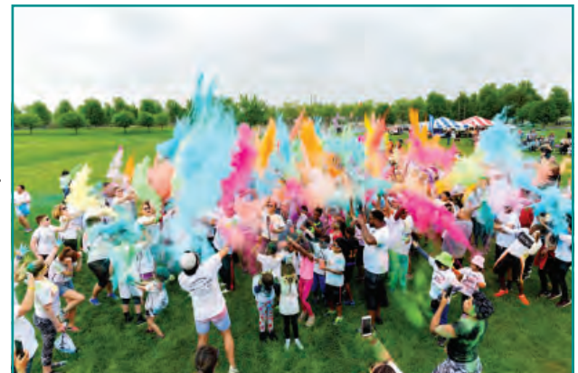
The first ever "Go the Extra Mile" Character Counts Color Run had 370 participants

The Recreation Division offered over 60 new programs and trips this year; and we continue to strive to offer more new and exciting programs each year. If you have an idea for a program or class that you would like to see offered at the Sports Hub, please stop in to speak with one of our Recreation Supervisors.