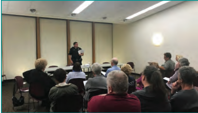
Neighborhood Watch rotates to various locations every month

Our state certified School Resource Officers spent the school year teaching Drug Abuse Resistance Education (D.A.R.E.) to 5th grade students, and addressing school related concerns. Through a cooperative agreement between the schools and the police department, one officer rotates between the schools that teach kindergarten through 8th grade, while a second officer rotates between the Glenbard District 87 schools that children from Glendale Heights attend. In addition to teaching classes and attending extracurricular activities, they also investigate police related incidents at the schools reported by students and staff.