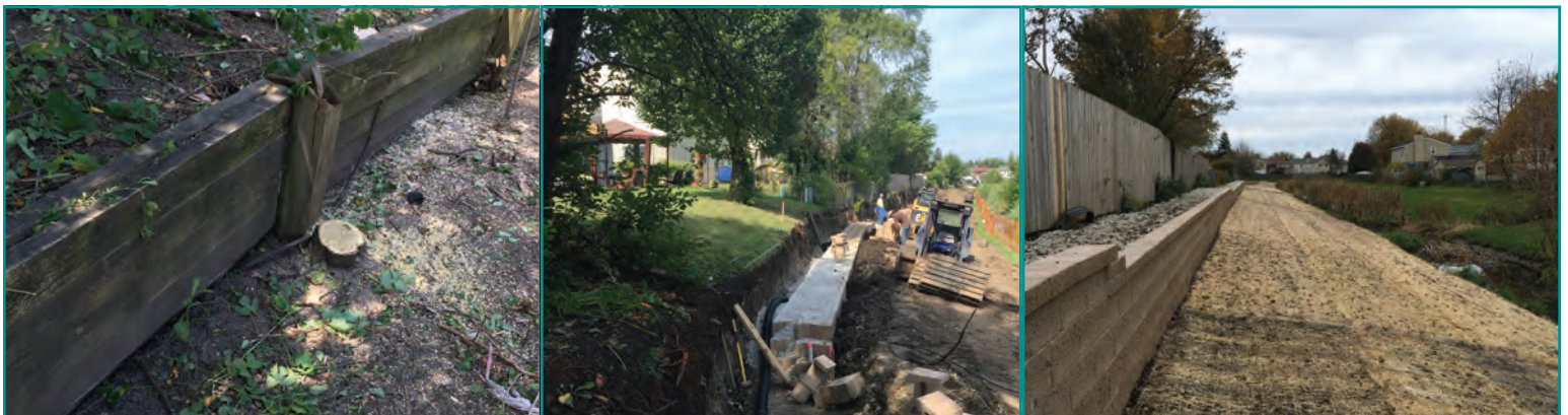
Hesterman Ditch retaining wall before, during and after

A highlight of this year's construction season was the Hesterman Ditch Retaining Wall. The Village replaced an aging and failing timber retaining wall with a block retaining wall spanning 650 feet. This ended the possibility of timber wall failure and erosion in the backyards of affected residents along Hesterman Drive. The project also included drainage improvements and landscape restoration of affected areas.