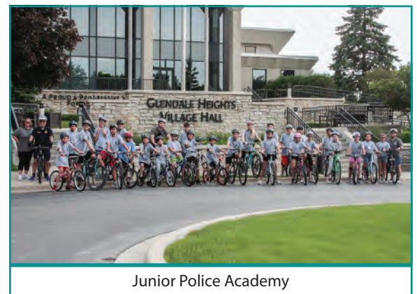
Junior Police Academy

For over 25 years, the police department has held week-long classes at Safety Town for children 5-7 years of age. The classes are held over the summer and taught by officers from the police department as well as representatives from the Railroad Operation Life Saver, Glenside Fire Protection District, First Student Bus Company and AMITA Health Adventist Medical Center GlenOaks. For children in 5th through 8th grade, the police department hosted the 12th Annual Junior Police Academy. Participants experienced various aspects of police work from the initial testing process to evidence processing, traffic stops and officer safety skills.