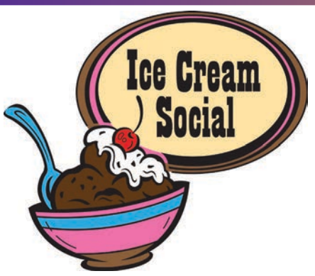
Celebrating National Senior Center Month!