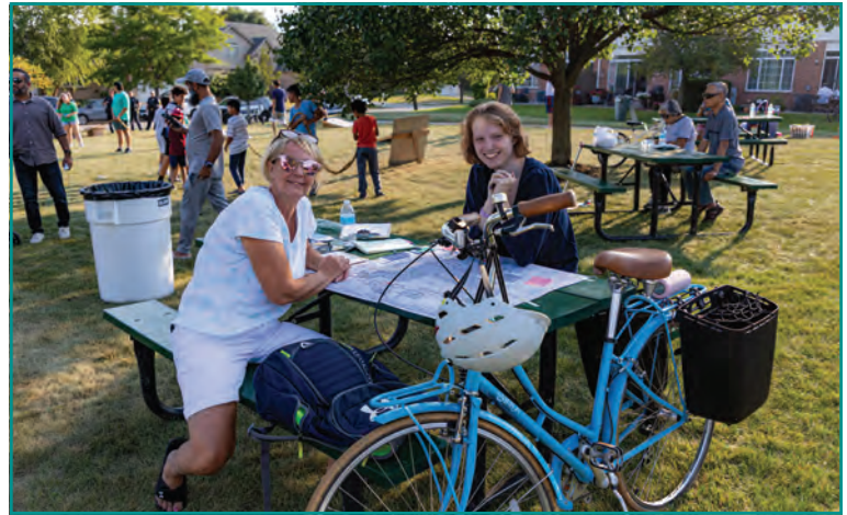
The Chicago Metropolitan Agency for Planning (CMAP) is working with the Glendale Heights community on a Bicycle and Pedestrian Plan

The Wastewater Treatment Plant completed an industrial user inventory as part of a condition of its Illinois Environmental Protection Agency (IEPA) Discharge Permit. The information provided from this inventory will ensure that all local businesses follow federal and local regulations when discharging wastewater into the Village's collection system. The Village also undertook a local limits study, subsequently amending 13 pollutants to ensure local businesses are discharging appropriate waste concentrations.