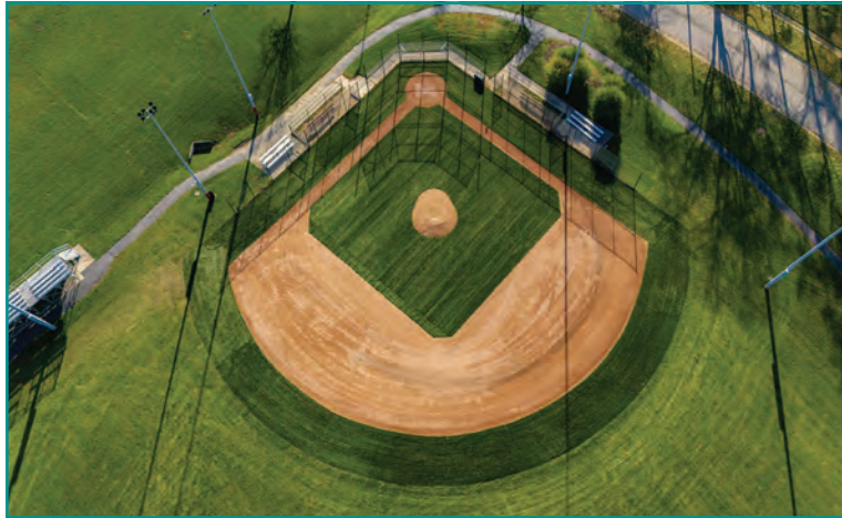
New baseball/softball fields were completed at Nazos Park which included regrading of the infield and outfields

In the fall of 2023, the turf field project began at Camera Park. This field change will convert the Camera lighted soccer field to artificial turf. This field will assure that recreation participants and public members can have a field that is playable in all weather conditions with minimal wear. This project is expected to be completed in the spring of 2024.