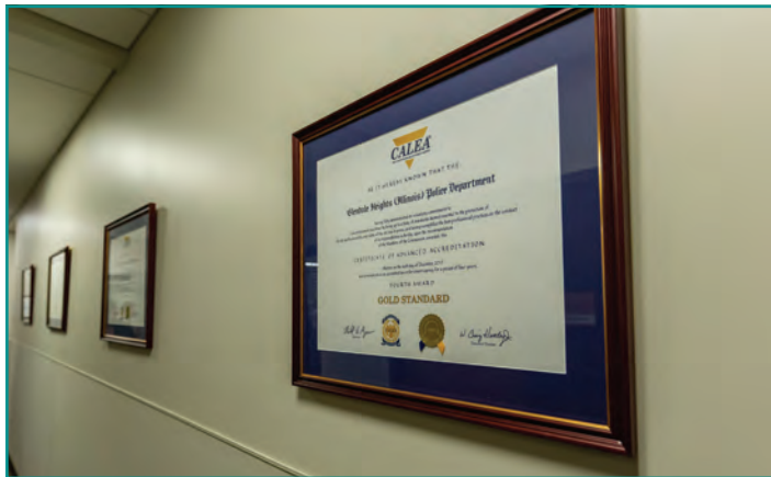
The Glendale Heights Police Department is one out of approximately 800 law enforcement agencies with CALEA Accreditation

I am immensely proud of the Glendale Heights Police Department for maintaining the Commission on Accreditation of Law Enforcement Agencies (CALEA) Accreditation. The police department earned their first accreditation in 2008 and was most recently re-accredited for the sixth time in 2022. CALEA Accreditation serves as the Gold Standard for Public Safety Agencies. Our police department is one of about 800 law enforcement agencies in the country who earned CALEA Accreditation