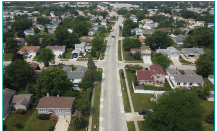
The majority of the permits reviewed are for residents making improvements to their homes and increasing property values

The department also manages regulatory stormwater management needs for the Village. The Community Development Department works in close coordination with other Village Departments, the DuPage County Stormwater Management Department, the Illinois Environmental Protection Agency (IEPA), the US Army Corps of Engineers (USACE), and the Federal Emergency Management Agency (FEMA) to ensure both public and private development activities meet their regulatory obligations for stormwater management. Activities include, public education and outreach, public participation and involvement on matters pertaining to stormwater impacts and regulations, illicit discharge detection and elimination, stormwater review and permitting, post construction runoff controls and inspections, pollution prevention and good housekeeping programs. In 2023, the Village of Glendale Heights issued 15 stormwater permits/certificates for various projects including, but not limited to, residential home construction,