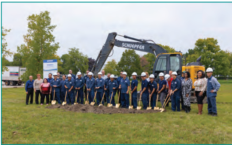
Sumitomo Drive Technologies broke ground for a new 44,000 square-foot building expansion

Economic Development is critical to community health by promoting structured and orderly growth, improved shopping and dining offerings for Village residents and visitors, and increased tax base through sales and property taxes; all of which contribute to improved property values for Village residents and businesses. The department utilizes all available resources, to include the management of seven Tax Increment Financing (TIF) districts to promote commerce and economic development within the Village.