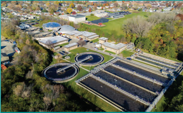
Numerous capital improvements projects were completed at the Wastewater Treatment Plant as required by the Illinois Environmental Protection Agency

The WWTP was successful in passing the annual Discharge Monitoring Report Quality Assurance Testing (DMRQA) as required by the IEPA. This annual testing ensures the Village's in-house laboratory procedures and methods meet or exceed the standards set forth by the Environmental Protection Agency (EPA).