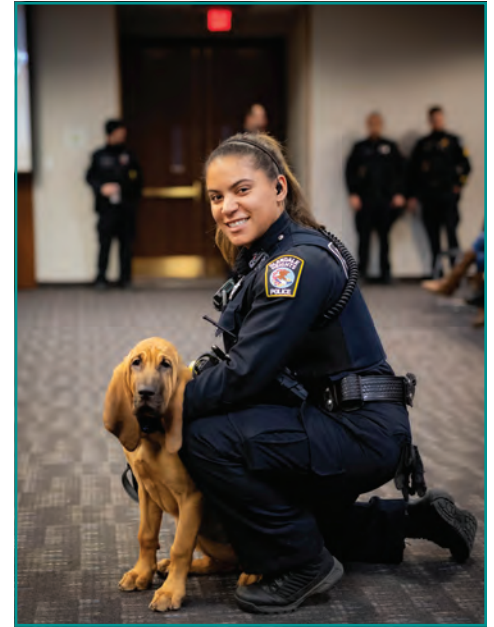
In thanks to Ivy Hall Cannabis Dispensary, the Glendale Heights Police Department introduced a new bloodhound named "Ivy"

The police department also organized a seasonal market in 2023 providing locally sourced food, produce, art, crafts and more. The goal of these events is to bring the community together, both as vendors and as customers, increasing interaction and dialogue with our Village residents.