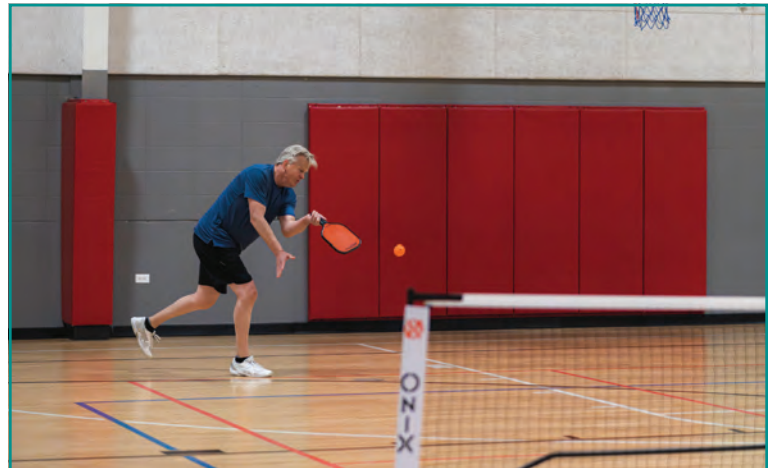
Pickleball is one of several new programs offered in 2023 with several new programs anticipated for 2024

The 2023 National Council on Aging Senior Center Month theme was: Discover Yours. We celebrated with a variety of pop-up events to encourage senior residents to try something new. The Center hosted a conference with the Association of Illinois Senior Centers in September. We shared our accomplishments throughout 2023 and collaborated on the best ways to