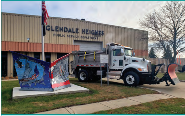
The Public Works Department added a 7th Peterbilt Aerial Man Lift Truck to the Fleets Division for various uses including snow removal

am pleased to report that all 616 IEPA samples resulted in no violations or water quality issues. Additionally, 30 lead and copper samples were completed with no lead detected over 15ppb.