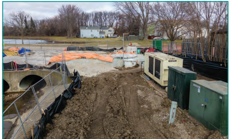
The Mill Pond Life Station Retrofit Project is scheduled to be completed in the Spring of 2024

Utilities Division staff continued to perform maintenance to the public water infrastructure system by responding to 33 water main breaks, seven fire hydrant replacements, 34 fire hydrant repairs, 42 b-box repairs, and 12 main line valve repair/replacements. Additionally, Illinois Environmental Protection Agency (IEPA) mandated water sampling was completed and I