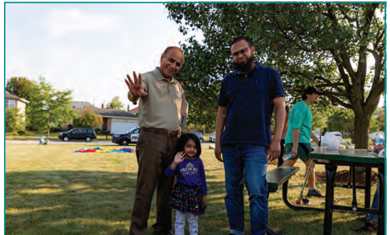
"With a shared vision and collective determination, we can all look forward to a future filled with community pride."