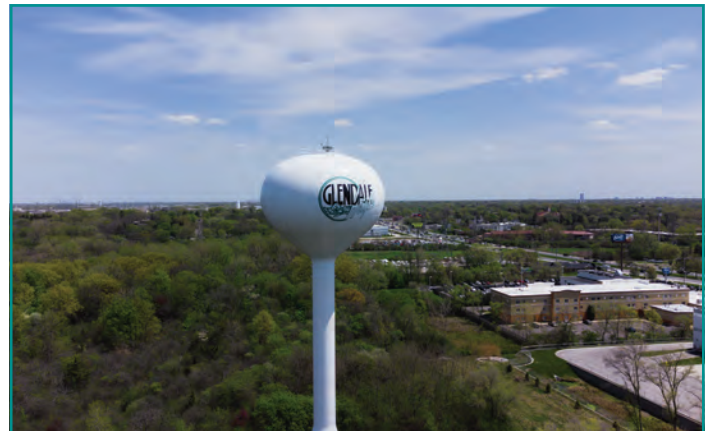
There was approximately 729 million gallons of water billed in 2023

The primary goal and responsibility of the Purchasing division is