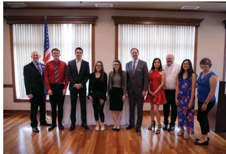
2019 Chamber of Commerce Scholarship Recipients

Scholarship applications & transcripts must be postmarked no later than May 17, 2020. The scholarship will be awarded at the club's monthly meeting on June 3, 2020.