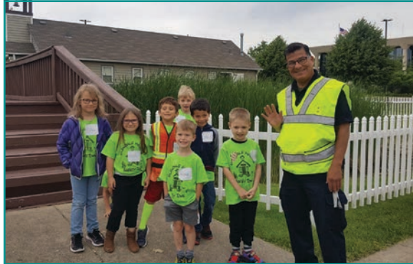
Safety Town Class

The police department is dedicated to its mission and working with the community to continue building relationships and trust. In 2019, the police department helped organize and participated in many events for all ages to continue to build relationships throughout the community.