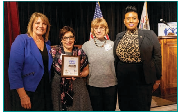
The Glendale Heights Mayor's Volunteer Initiative Program Winner of the 2019 Governor's Hometown Award

Volunteerism is an important part of our Center. In 2019, 47 individuals volunteered 2,239 hours to benefit the Center. These volunteer members and their donation of time are very important to the growth of the Center. In fact, they are so important that the Center for Senior Citizens was awarded the Governor's Hometown Award for Volunteerism in November of 2019. I am very proud of the hard work the Center for Senior Citizens has done to grow our volunteer program.