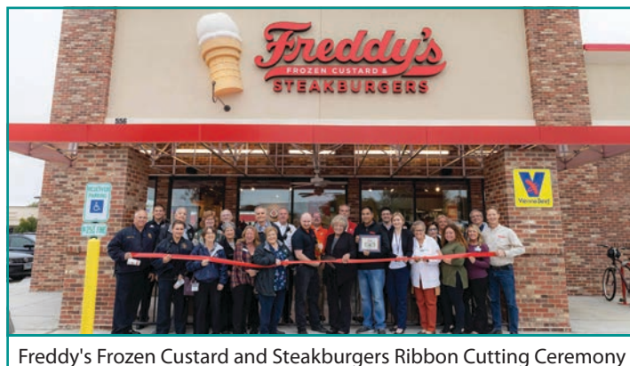
Freddy's Frozen Custard and Steakburgers Ribbon Cutting Ceremony

In 2019, the Community Development Department received 3,091 building permit applications for industrial, commercial