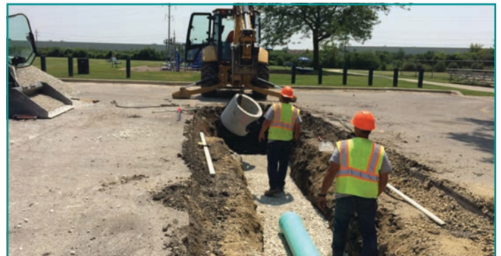
New Storm Sewer System at Ollman Park

Streets Division Staff responded to 28 snow and ice events throughout last year's winter season, plowing and de-icing 76 center lane miles of roadway and 147 courts during each event. The Street Division also responded to 44 separate flood control events including clearing of storm inlets and streams to alleviate standing water on roadways. Additionally, the Division responded to 375 work orders in 2019, and completed over 2,700 JULIE locates for buried utility services.