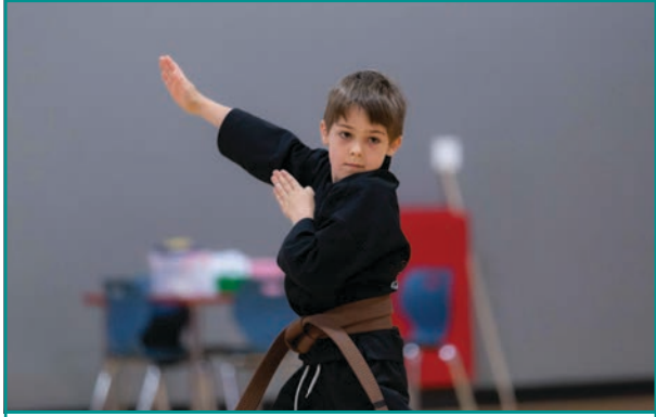
Martial Arts Featured at Rec-in the Hub

For the second year, the Recreation Division increased offerings by nearly 60 programs and trips as we continue to offer new and exciting programs for the residents of Glendale Heights. A few of these new programs included the "Play at the Hub" (PATH) Program which added a before school component and 16" Softball returned to Glendale Heights last summer as teams played weekly at Camera Park. If you have an idea for a program or class that you would like to see offered at the Sports Hub, please stop in and speak with one of our Recreation Supervisors.