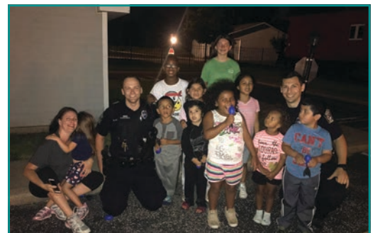
Movie with a Cop

The police department sponsored the Village's 21st Annual National Night Out in August of 2019. The event was held on the Village of Glendale Heights Civic Center campus, and residents were offered free food and games. National Night Out is held to raise crime and drug prevention awareness and strengthen our police and community partnerships. We want to thank the many other community groups who help make this event a huge success each year! The police department also sponsored a new event this past year, Movie with a Cop, held in July and August. Based on the turnout and public feedback, the police department will make this an annual event.