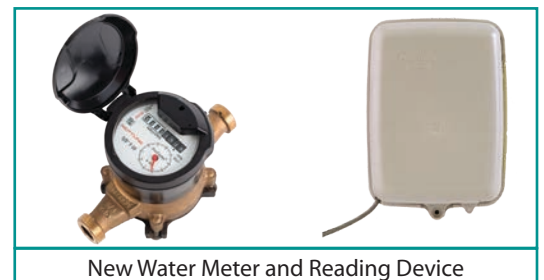
New Water Meter and Reading Device

The Village began an ambitious project in 2019 to replace every water meter and water meter reading device in the Village. The current residential meters are over 20 years old and commercial meters, in some cases, are over 40 years old. Additionally, the reading devices are no longer being serviced or manufactured. Many of these devices have begun to fail resulting in the need to issue estimated bills. The Village contracted with Water Resources, Inc. to undertake this $3.2 million project. Work began this past November, and is expected to continue into late summer 2020. This is the first project to be undertaken from the earlier noted infrastructure improvement plan. For more information and to determine when we will be in your area replacing water meters, please visit www.glendaleheights.org/watermeter .