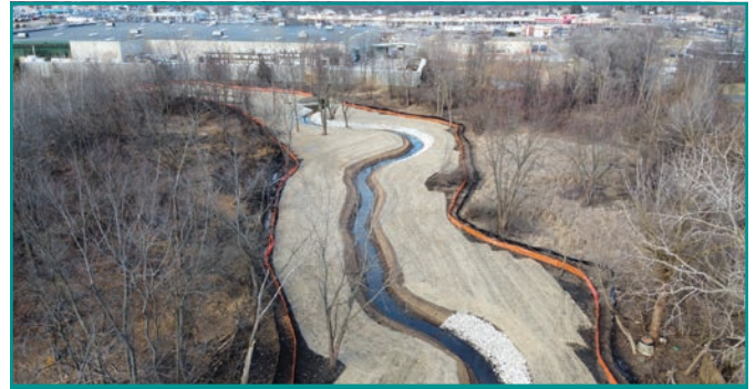
East Branch Tributary 2 Channel Maintenance Project

A third CDBG project for the year was the $875K East Branch Tributary 2 Channel Maintenance project. The Village's contractor dredged a section of the creek that was causing drainage problems in the creek. The improvements included streambank stabilization, dredging, vegetation management of invasive species, and the planting of new trees and shrubs. This project will improve drainage in the surrounding area, as well as removing obstructions from drainage areas. The Village can receive up to $400K in grant money reimbursement for this project.