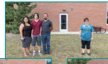
2020 Chamber of Commerce Scholarship Recipients