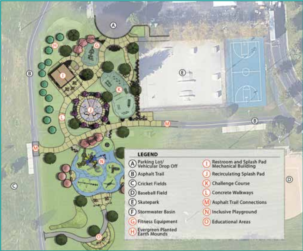
Proposed Rendering of the New Camera Park Coming in 2021

A Haunted Trail was held at Camera Park in October as part of Halloween and a Day of the Dead celebration was held in