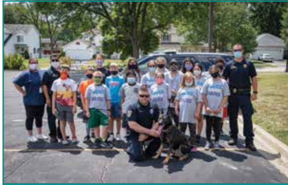
Junior Police Academy

The police department is dedicated to its mission and working with the community to continue building relationships and trust. In 2020, the police department helped organize and participate in many events for all ages to continue to build relationships throughout the community.