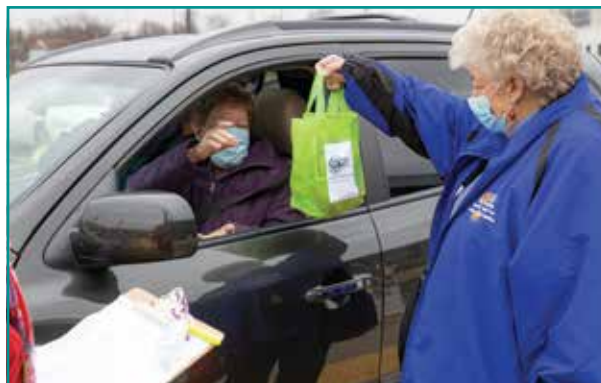
Drive-thru events were hosted for members of the Center for Senior Citizens

The Center for Senior Citizens celebrated their 10-year anniversary in August of 2020. Although we were not able to host a celebration like we had originally hoped, the Center for Senior Citizens created a video production and a publication with pictures from the past 10 years remembering all of the wonderful events and programs we celebrated over the past decade.