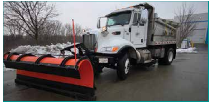
Peterbilt Truck with Stainless Steel Salt Spreaders and Dump Bodies

The Fleets Division has made changes to its heavy truck purchases over the last few years. The Division is now purchasing Peterbilt trucks with stainless steel salt spreaders and dump bodies. The Division will continue to service and repair over 350 vehicles and pieces of equipment serving various Village Departments. In house repairs and maintenance allows for a quick turnaround and lower costs made possible by our three highly trained mechanics.