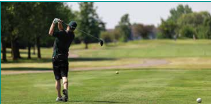
Golf reopened in May with COVID-19 health protocols

Glendale Lakes Golf Club (Glendale Lakes) generated just under 29,000 rounds of golf for the 2020 calendar year. This was a significant increase in rounds from last year even though there were several golf restrictions in place due to the COVID-19 pandemic. The golf season started in early March and the golf course was open for two weeks before the COVID-19 pandemic hit. The golf course was required to be closed on March 21st as it was considered part of the Stay at Home Order issued by the State of Illinois.