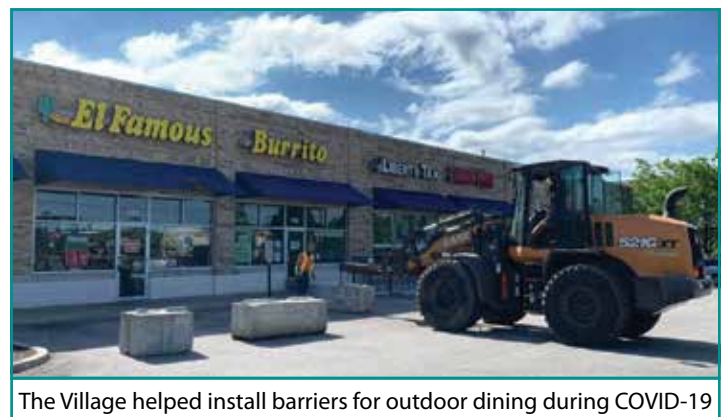
The Village helped install barriers for outdoor dining during COVID-19

Over the past several years, the Village has worked to address an area along Army Trail Road that includes significant outdoor truck storage on unpaved surfaces and other uses that have negatively impacted the surrounding neighborhood. The Village fought a number of court battles and had many meetings with neighbors to keep them up-to-date on the efforts. In late 2020, the Village received a proposal to redevelop the area and the Plan Commission considered the redevelopment of this