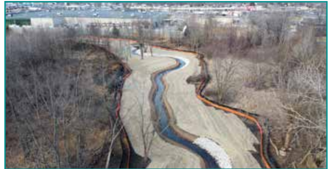
East Branch Tributary 2 Channel Maintenance Project

The Village also completed the "heavy construction" phase of the $875,000 East Branch Tributary 2 Channel Maintenance Project. The Village's contractor dredged a section of the creek that was causing drainage problems in the creek. The improvements included stream bank stabilization, dredging, vegetation management of invasive species, and the planting of new trees and shrubs. The project is now in the phase of planting and managing native species, which will continue for the next five years. The Village will receive $400,000 in CDBG grant money reimbursement for this project.