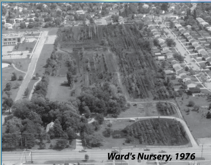
Ward's Nursery, 1976

I was eight years old, the Village on the edge of farmland was beautiful to be hold.